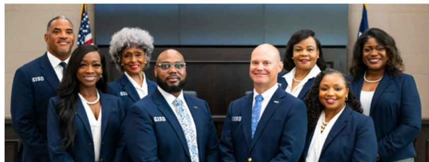
2024-25 CROWLEY ISD BOARD OF TRUSTEES