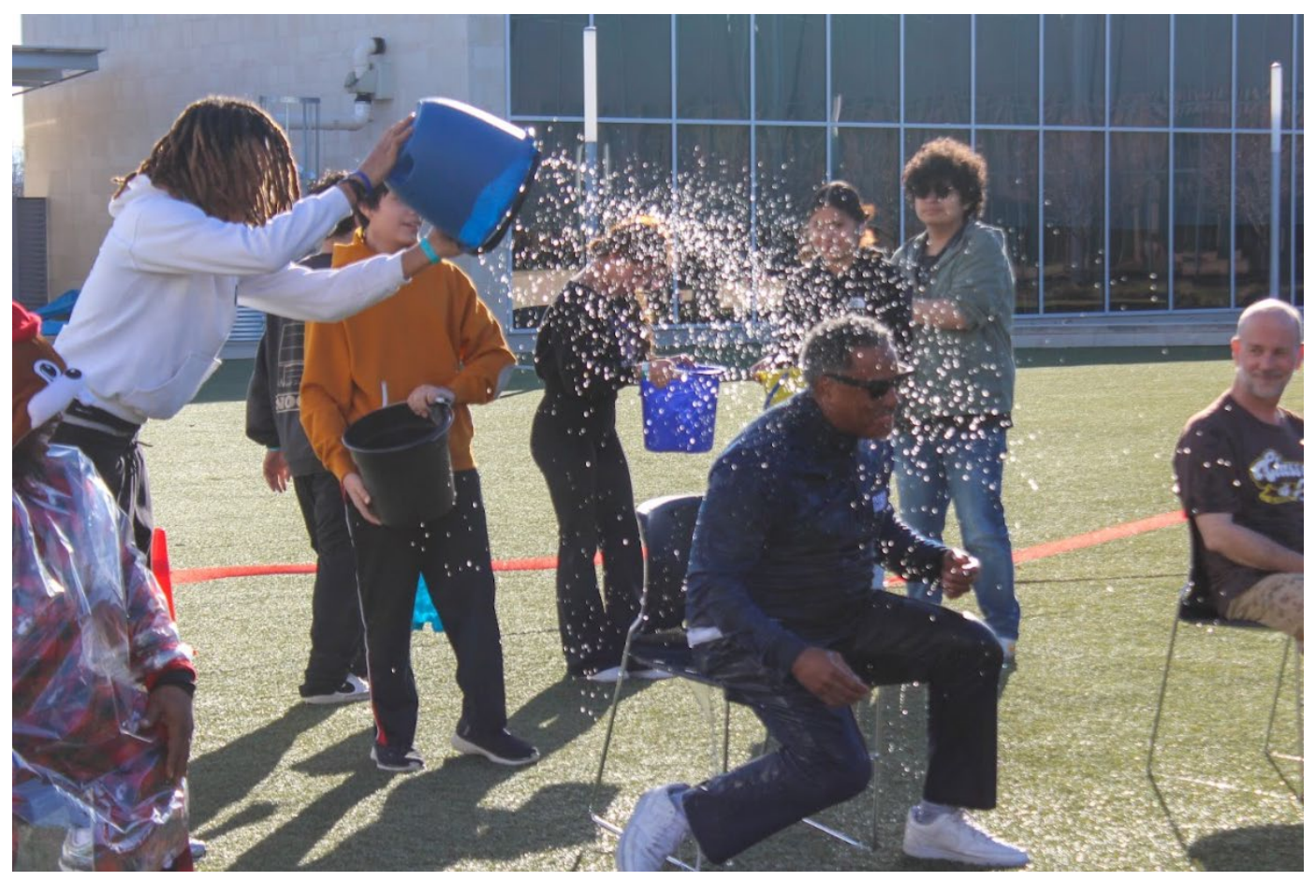
Polar Bear Splash