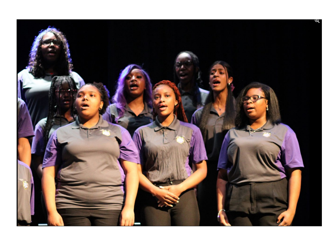
Black History Month Celebration